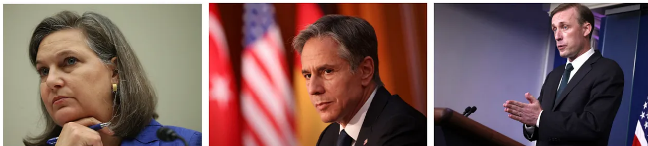
THE PLAYERS Left to right: Victoria Nuland, Anthony Blinken, and Jake Sullivan.

destruction of the two Nord Stream pipelines—and that he was delivering on the desires of the President.