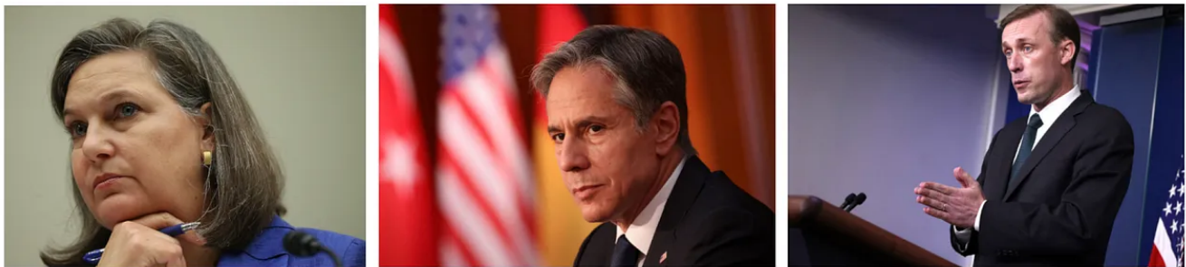
THE PLAYERS Left to right: Victoria Nuland, Anthony Blinken, and Jake Sullivan.

What became clear to participants, according to the source with direct knowledge of the process, is that Sullivan intended for the group to come up with a plan for the destruction of the two Nord Stream pipelines—and that he was delivering on the desires of the President.